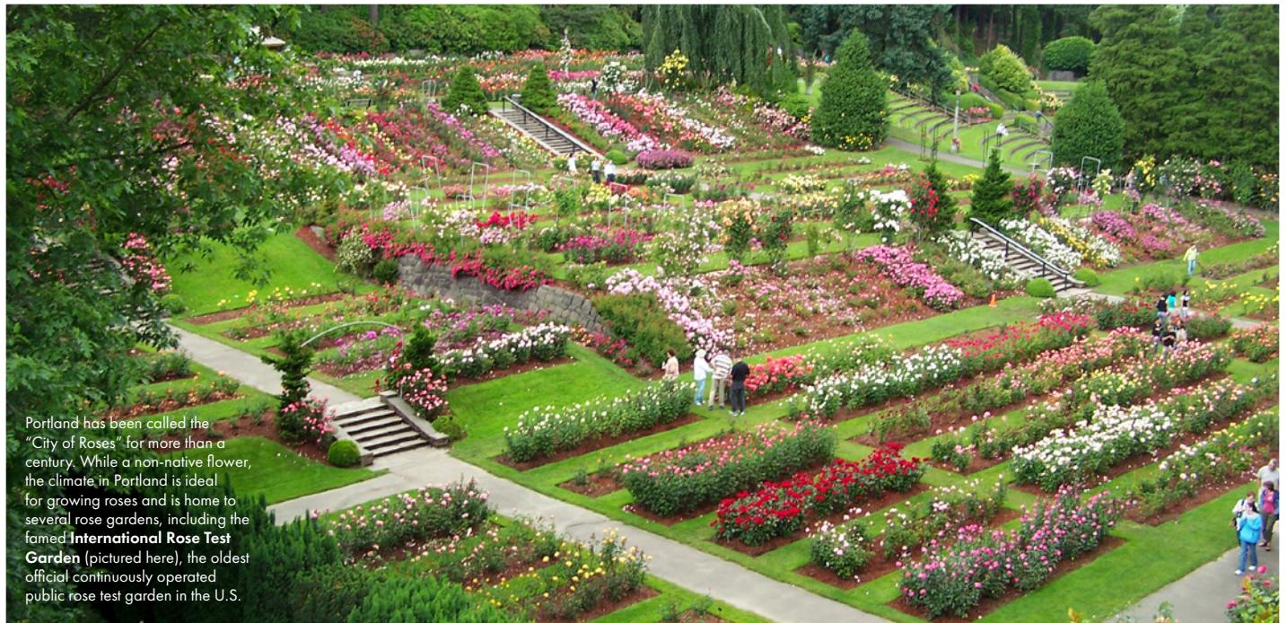
Portland has been called the "City of Roses" for more than a century. While a non-native flower, the climate in Portland is ideal for growing roses and is home to several rose gardens, including the famed International Rose Test Garden (pictured here), the oldest official continuously operated public rose test garden in the U.S.